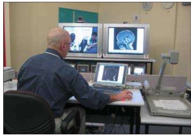
Figure 4: A paediatric neurologist discusses the results of an MRI scan during a telepaediatric consultation

The success of the telepaediatric service is most likely due to a number of factors. These include the unique model used to receive and respond to referrals, the role of the telepaediatric