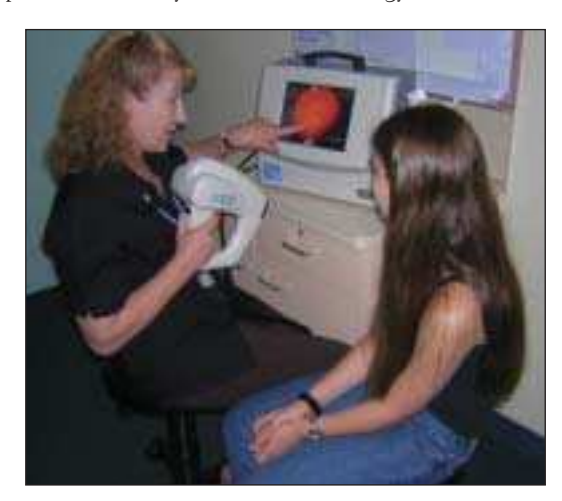
Figure 8: Digital images of the retina can be collected by a trained operator and e-mailed direct to a specialist for assessment

Our own investigations into the use of videophones for the clinical and psychosocial support of children and their families in their homes<sup>[36, 37]</sup> use readily available technology (personal computers, web cameras, modems and NetMeeting software) and the ordinary home telephone line (Figure 5). Telemedicine does not have to be expensive or complicated. Simple commercially available technology can be used. Like-