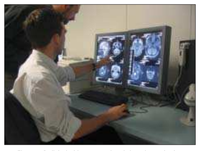
Figure 9: Radiological images are viewed via an image database