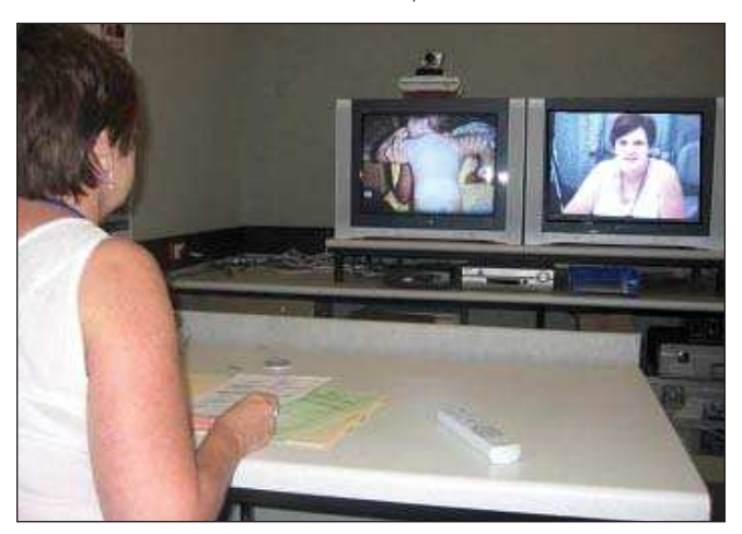
Figure 3: Post-acute burns care via videoconference

(Figure 3), cardiology, diabetes, ENT (ear, nose and throat), nephrology, neurology (Figure 4), oncology, orthopaedics, psychiatry and surgery.