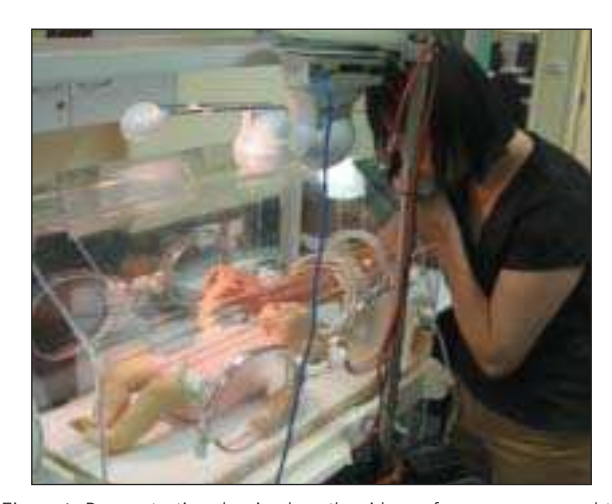
Figure 6: Demonstration showing how the videoconference camera and the telephone are used for communication with the specialist

In the previous example the use of relatively high bandwidth telemedicine systems to deliver health services in rural areas has been described. In this case individuals in a rural hospital consult with individuals in a tertiary hospital. With an ageing population and changing health problems there is a growing trend and necessity to treat patients at home. Home health care has been defined by the World Health Organization (WHO) as the "provision of health services by formal and informal caregivers in the home in order to promote, restore and maintain a person's maximal level of comfort, function and health including toward a dignified death". [23] The possibility