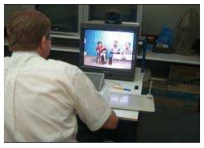
Figure 2: Discussion via videoconference between family and paediatrician (on screen) and specialist

We have conducted over 3000 consultations for children living in regional and remote areas of Queensland. More than 35 different paediatric sub-specialties are offered, including burns