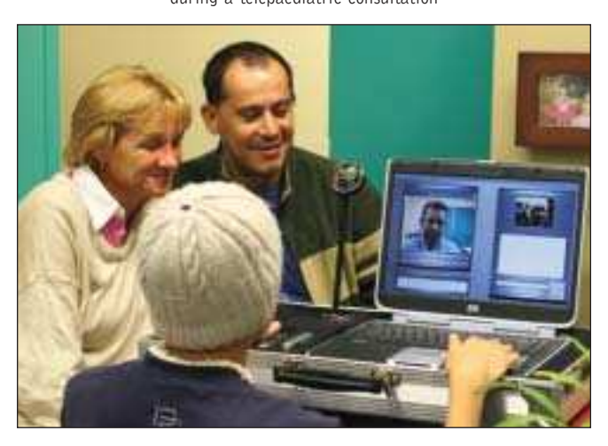
Figure 5: An example of remote consultation via videophone between the family home and a hospital specialist