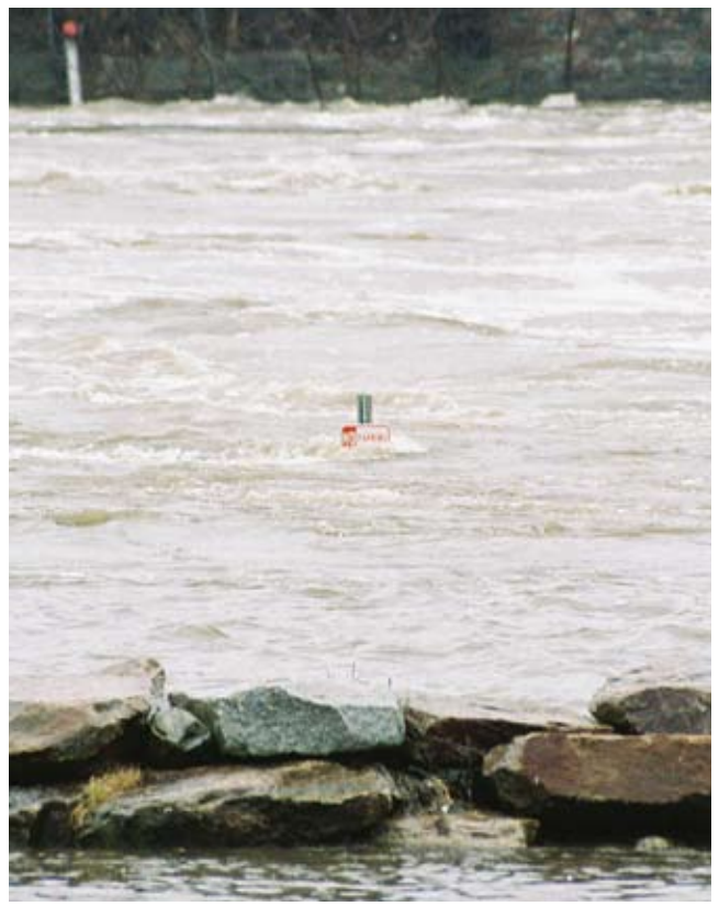
A traffic sign in Lawrence, Massachusetts, engulfed by the Merrimac River. The river crested 2.4 meters above flood stage on May 15th, 2006.

At the onset, students found that working with data was a bit challenging. I could see that scaling the graphs was a struggle for them because many had lines running off the sheet. However, once they moved past this, many immediately made the connection between the rain amounts and the flood conditions. In this way the activity proved to be a valuable learning experience because while they connected to the topic of rivers and gained skills in mathematics and inquiry, they were engaged and excited to learn more about the "100-year flood."