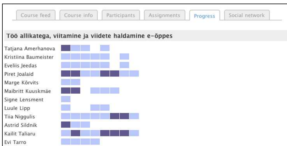
Figure 2. Progress page displays participants' progress