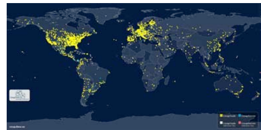
Figure 1. CmapTools users throughout the world.

The 2000's have seen a continuous growth in the use of concept mapping and in its applications. This growth is reflected in the extensive participation and wide-ranging topics presented at the Concept Mapping Conferences (Cañas & Novak, 2006a; Cañas, Novak, & González, 2004; Cañas, Reiska, Åhlberg, & Novak, 2008) and in the active Cmappers community (the informal community of concept mappers around the world). Figure 1 shows how CmapTools users connecting to CmapServers cover large portions of the world.