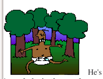
just a babe in the woods. An innocent. An inexperienced person in a