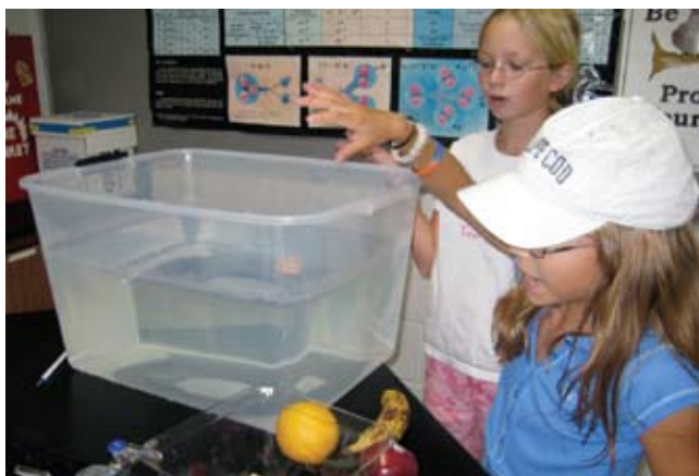
Students explore items that sink or float.

that were sparked by their explorations. The following questions are examples of what students have pursued: