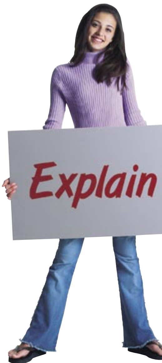
FIGURE 2 Example explore activities.

In order to effectively use analogies to explain scientific concepts, teachers should explicitly identify both the similarities and the differences between analog and target concepts (Treagust 1993). If a teacher only says that “a chemical equation is like a recipe” (Figure 3), students may not understand how the two concepts are similar and how the two concepts are different. As a