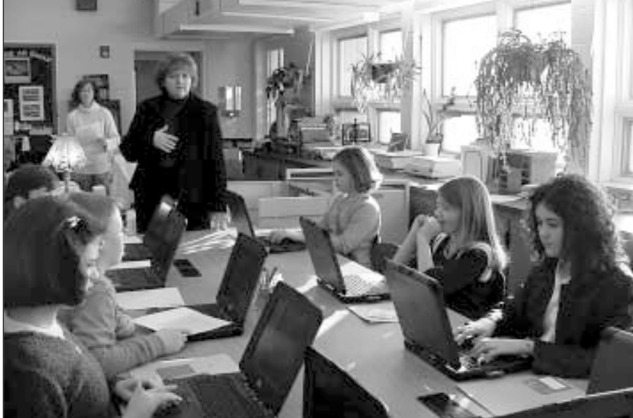
Figure 3. Educational technologists and teachers can use the mobile laptop lab in any classroom.

Professional development opportunities for teachers often are hit or miss or have limited immediate application to what they are doing in their classrooms. By the time the teachers have an opportunity to apply the skills they have learned, too much time has passed for them to remember how to complete tasks using technology. C \cdot R \cdot E \cdot A \cdot T \cdot E 's goal is to avoid these and similar pitfalls.