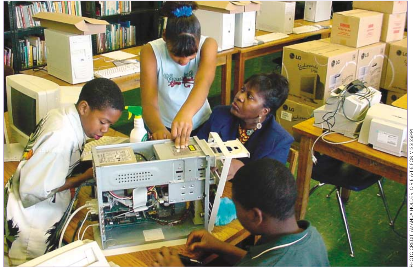
Figure 1. Educational technologists and student techno teams provide on-site technical support for teachers in the core schools, essential to helping teachers integrate technology.

C·R·E·A·T·E FOR MISSISSIPPI'S SCHOOL MENTOR PROGRAM