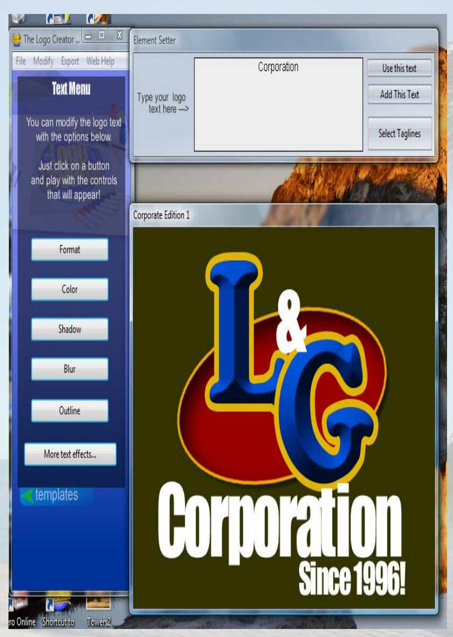
Selecting an item will let you modify its format, color, shadow, etc.

After choosing the Logo you will be able to modify any of its items. Just click on any text item or image.