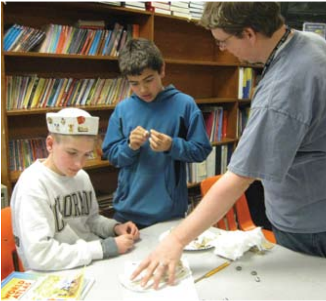
Students worked in cooperative groups to make and study mummies.