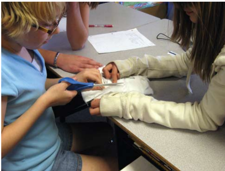
Students cut each layer of muslin using scissors. Because layers contained writing and illustrations, it was important to document the observations before removing layers. Some mummies had artifacts tucked in between layers, as well.

2. Gathering and preparing artifacts: The third student in the group gathered materials from the front of the room to make or prepare artifacts. First, however, the group decided what culture their mummy would represent. They decided what artifacts were culturally appropriate (using their field-guide data). We reminded students to